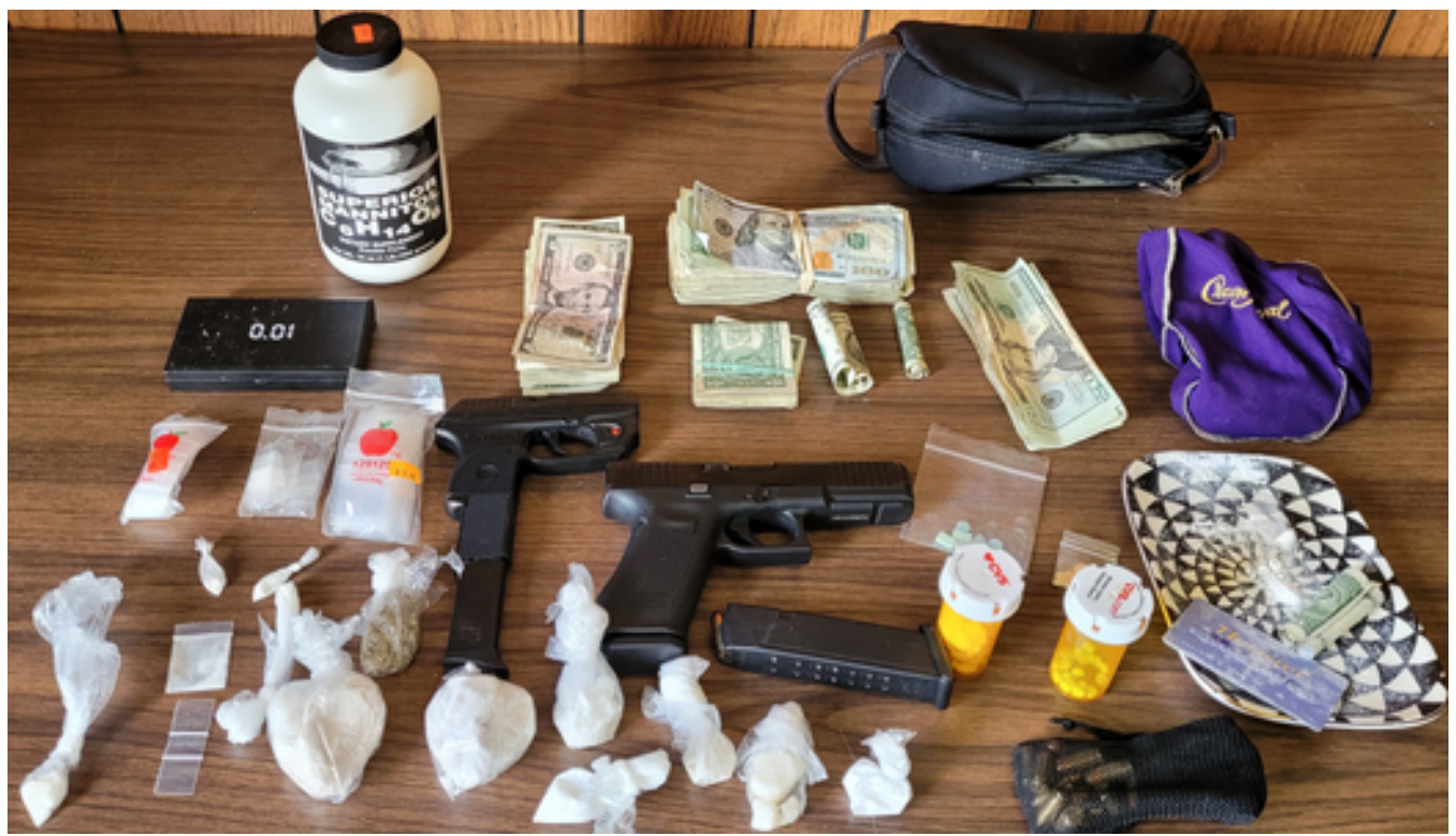
(More photos below)